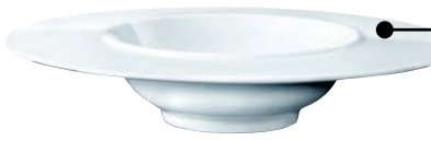
'Exquisite' Deep Plate: 16,24,28cm