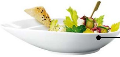
'Bloom' Bowl: 130x94.5, 191x140, 241x191mm