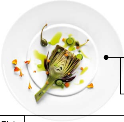
'Exquisite' Flat Plate with Rim: 16,21,24,28,31cm