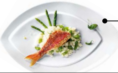
'Leaf' Platter: 158x99, 332x210, 390x240mm