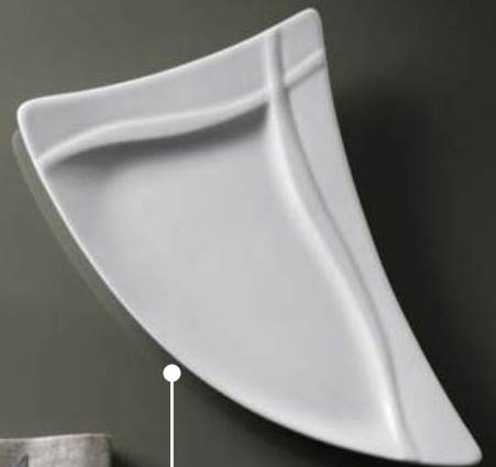
Triangle platter with rim (on two sides): 21, 32, 36, 38cm