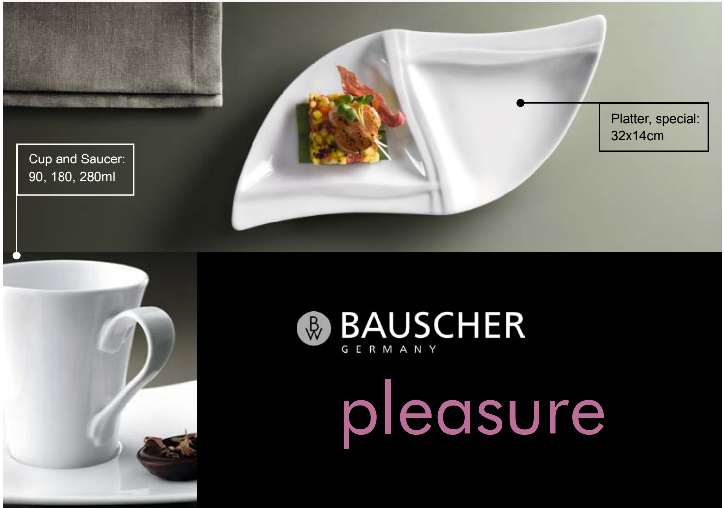
Cup and Saucer: 90, 180, 280ml