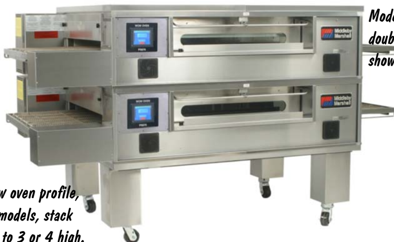
Model PS670 double stacked shown.

Low oven profile, 4 models, stack up to 3 or 4 high.